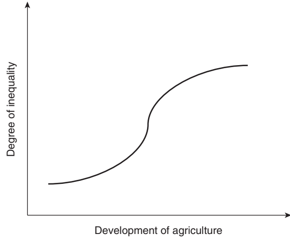
Figure 5.1 A single social equilibrium.